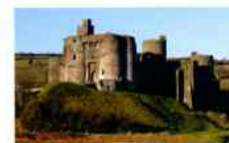
KIDWELLY CASTLE SOUTH WALES 2012 CASTELL CYDWELI DE CYMRU 2012 SCULPTURE CYMRU